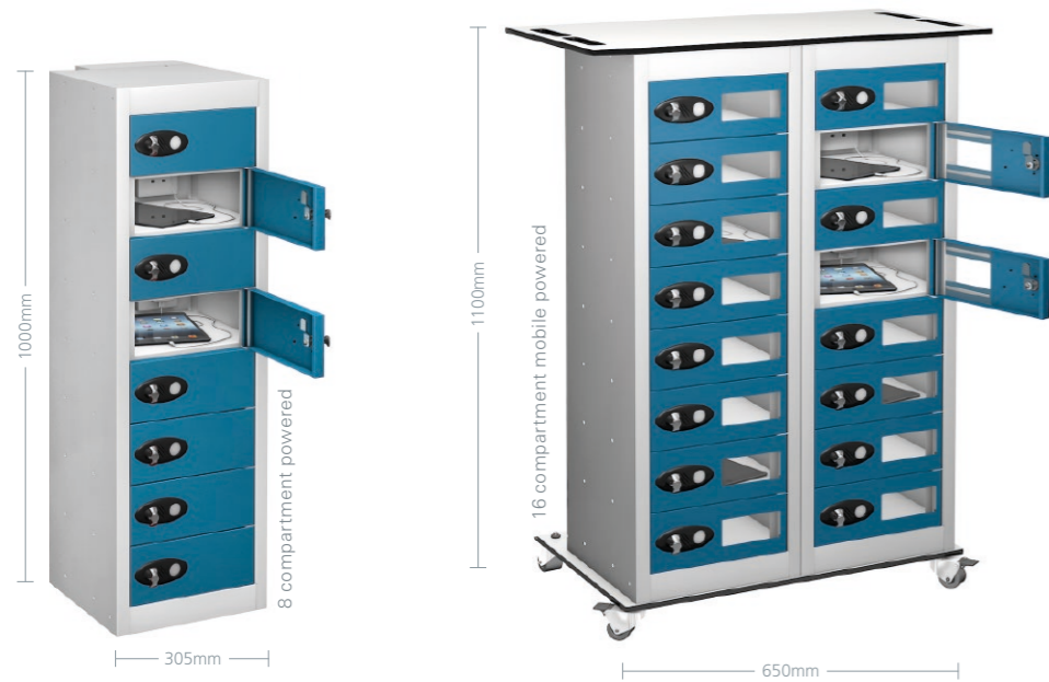
Charging External Depth 370mm

charge and store smaller devices such as phones, tablets, body cams etc.